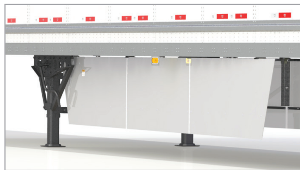
Impact and abrasion resistant – made with highly engineered composite panels for optimum flexibility, strength and durability